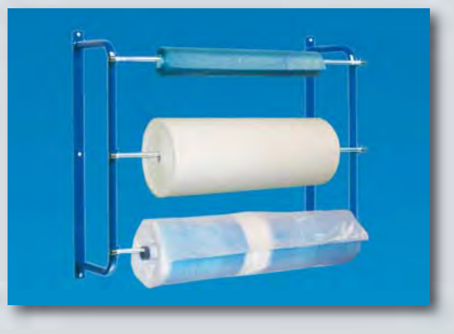
Wall bracket for three compact rolls(O/N D-R 38)creates clarity and accessibility, for all Datex compact rolls,<br/>sturdy, wall-mounted steel tube construction,<br/>including mounting material.(O/N D-R 37)Wall bracket for one compact roll(O/N D-R 37)(without picture)(O/N D-R 37)