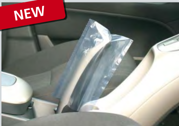
Disposable handbrake protection (O/N D-HB 2010) made of polyethylene, transparent, on a compact roll, size: 100 x 180 mm, 500 units per compact roll.