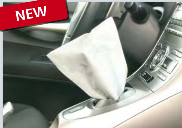
Disposable gear shift protection (O/N D-SH 2020) made of polyethylene, white, on a compact roll, size: 145 x 160 mm, 500 units per compact roll.