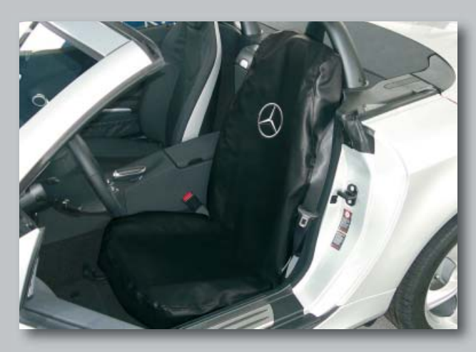
Seat cover MB (O/N D-S 15 MB)

The seat cover reliably keeps stains off the front seats. Made of strong black artificial leather. All twin seams, strained seams are reinforced by artificial leather. Washable at 30 °C. With silkscreen imprint of the MB star to support the workshop's image.