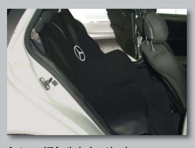
Seat cover MB for the back seat bench (O/N D-S 16 MB)

Size: large universal size Weight: about 0.8 kg Packaging: 1 piece