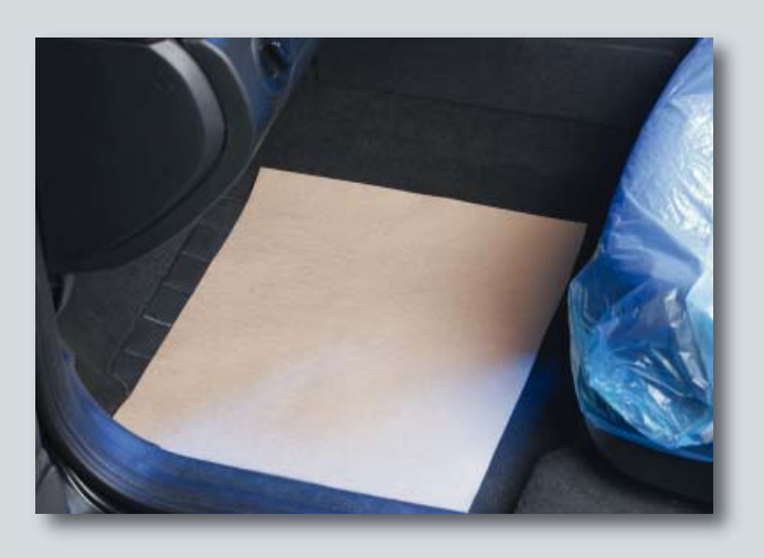
Floor protection, crepe paper