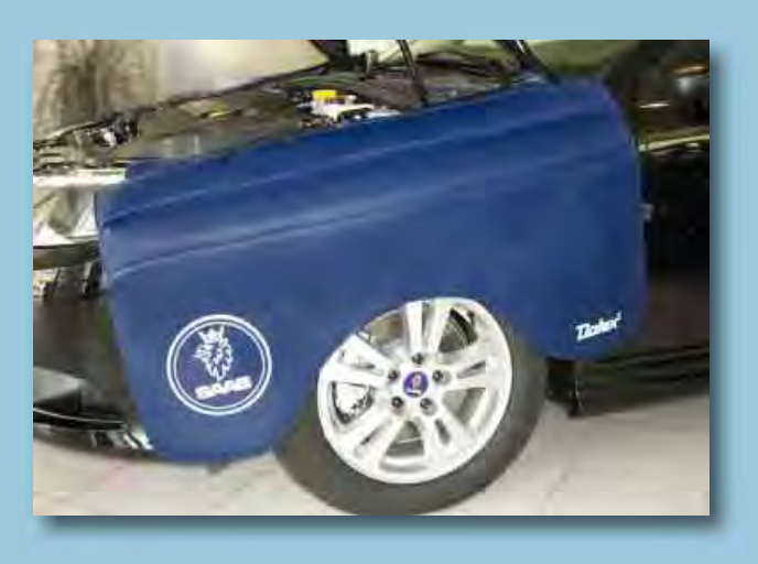
Brand specific fender covers for Saab