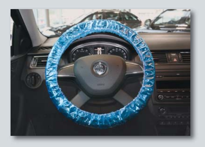
Reusable steering wheel cover elasticated, for passenger cars, made of extra strong polyethylene, colour: blue, 20 pieces per box.