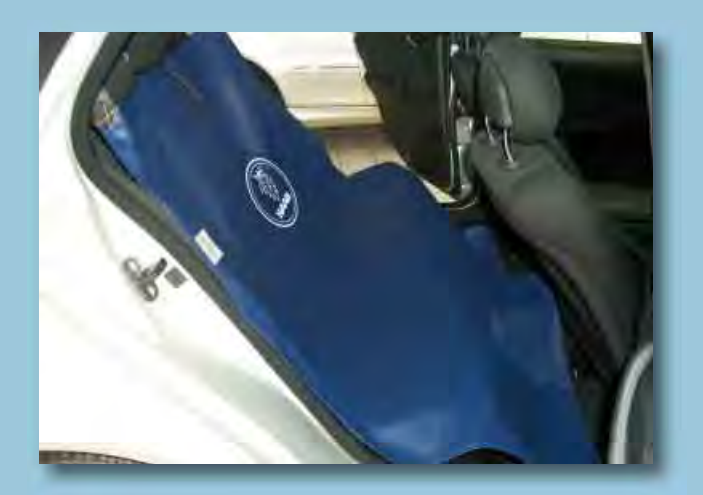
Back seat bench cover for Saab