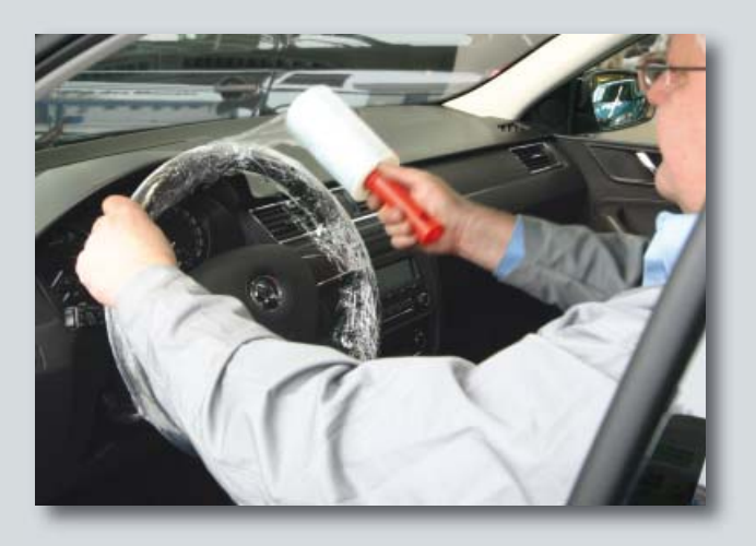
Disposable steering wheel and gear shift cover (O/N D-L 42) for steering wheels of passenger cars and lorries, adhesive polyethylene foil with handle, for about 250 applications.