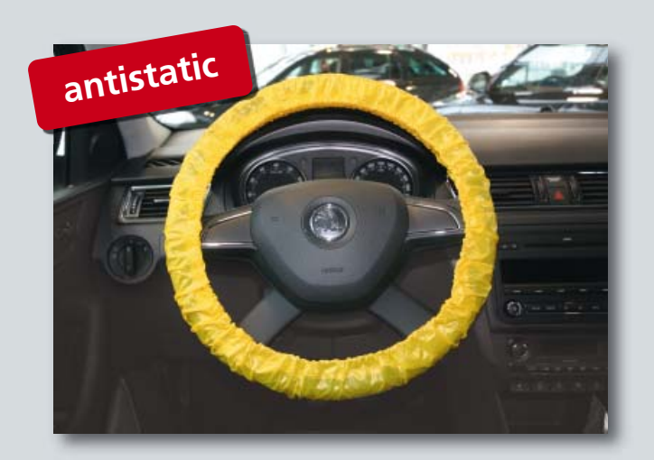
Reusable steering wheel cover "antistatic" (O/N D-L 3100) protection of electronic devices against electrostatic discharge, elasticated, for passenger cars and lorries, made of extra strong polyethylene with antistatic material fractions, yellow identification colour, 20 pieces per box.