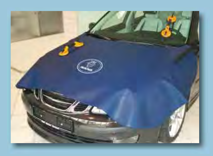
Brand specific bonnet cover for Saab

Made of blue foam-coated artificial leather, with extra strong additional padding. With white imprint of the Saab logo to support the workshop's image. Non-scratch attachment without magnets. Size: approx. 113 x 69 cm