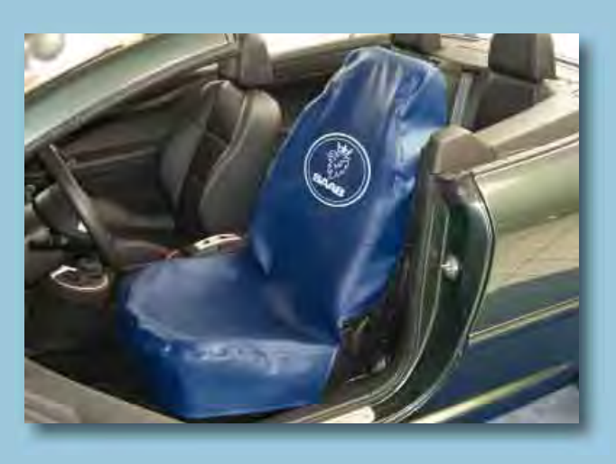
Seat cover for Saab

With white imprint of the Saab logo to support the workshop's image. Simple and strong attachment by suction cups on a web belt. Size: approx. 150 cm x 145 cm