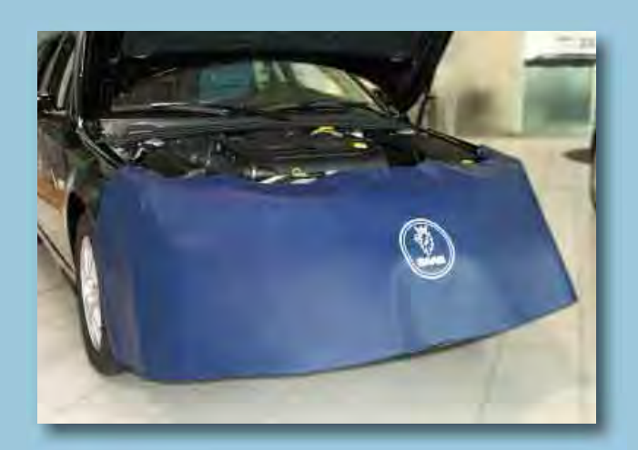
Brand specific front cover for Saab