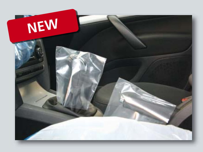
Disposable cover for gear shift and handbrake

made of transparent polyethylene, (O/N D-SH 2020) size: 145 x 160 mm, 500 units per box.