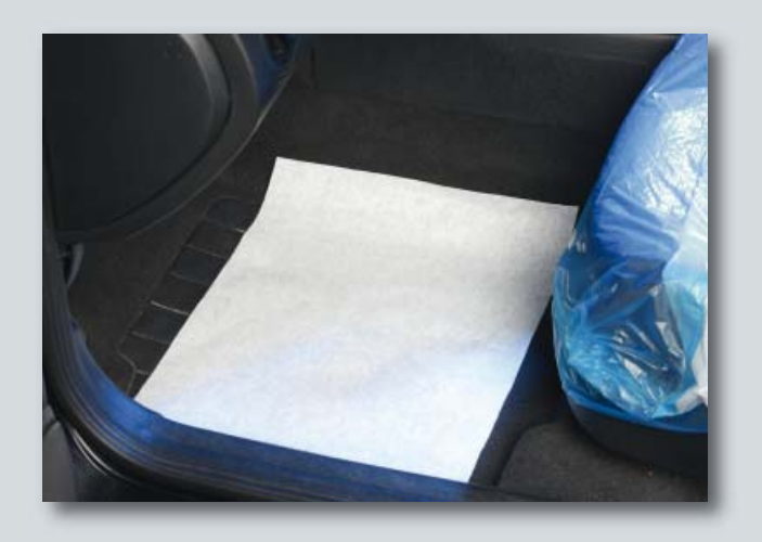
Floor protection, crepe paper

size: 550 x 610 mm, 500 units per compact roll.